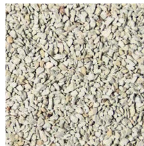
Grain size: 0,5 – 1 mm